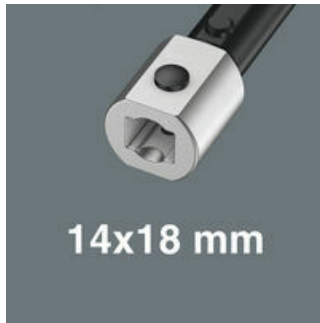
With safety pin

For torque wrenches of the Click-Torque X series with 14x18 mm holder.